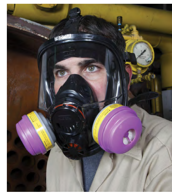
Protection against respiratory hazards is more than a nuisance—exposure to dust, gases and vapors can lead to serious, life-threatening diseases.

In 2018, the fourth-most cited OSHA standard was the Respiratory Protection